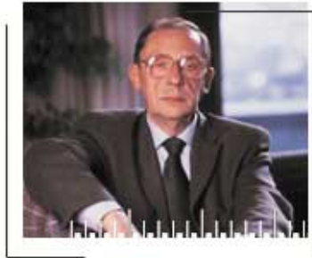
Òscar Ribas Reig Chairman of Banca Reig and vice-chairman of Banc Agrícol